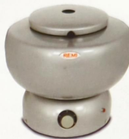
C-854 / 8